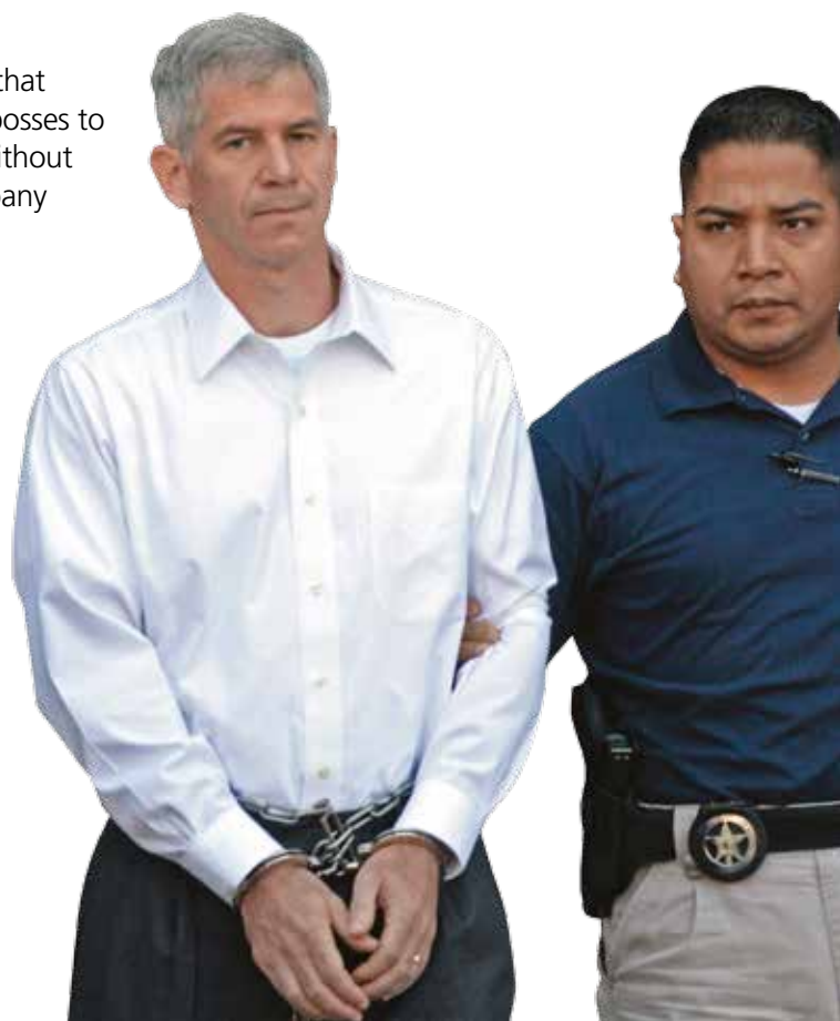
Former Enron chief finance officer Andrew Fastow in shackles and handcuffs.

Their tendency to indulge in 'casino capitalism' antics, gambling with shareholders' and employees' investments and savings to line their own pockets, and their assumption that the share price would continue to rise indefinitely, match some key characteristics of extraverts: aggression, risk-taking, excitement-seeking and optimism.