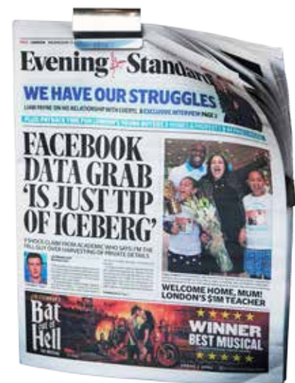
Data breaches can threaten millions of social media users.