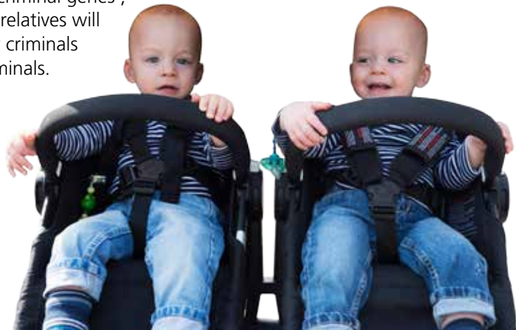
Identical twins, identical genes. Does this mean identical risk of criminality?

Genetic theories have used studies of identical twins as a way to test their theory of criminality. This is because identical or monozygotic (MZ) twins share exactly the same genes – they both developed from the same fertilised egg. Therefore if one twin is criminal, the other twin ought to be criminal too.