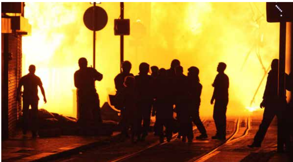
The London riots, August 2011. Firefighters and police attend a burning building in Croydon.