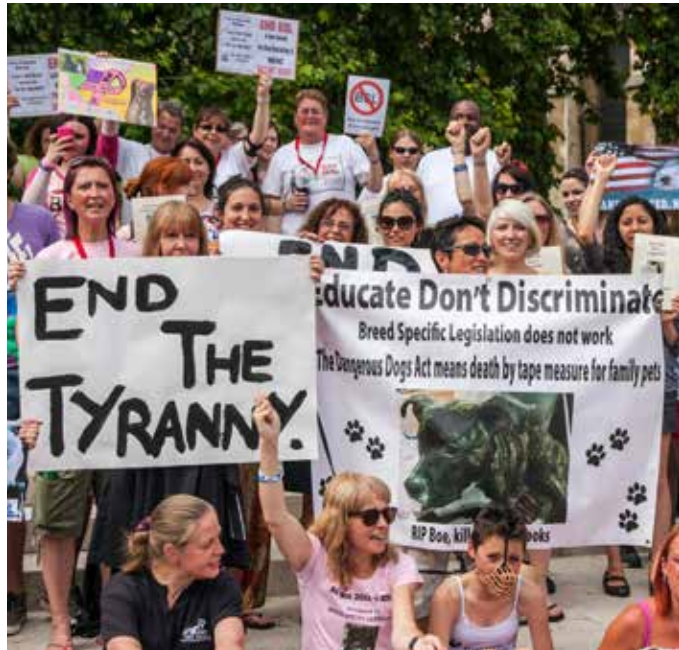
Dog lovers protest against breed specific legislation for so-called dangerous dogs.

Change in the law Finally the government changed the law specifically to stop raves. The 1994 Criminal Justice and Public Order Act applies to open-air gatherings of 100 or more people where amplified music with repetitive beats is played at night and is likely to cause distress to local residents. (This is the only time a particular style of music has ever been made illegal.) Those attending the rave can be arrested without a warrant.