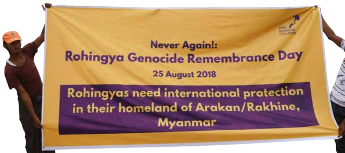
Ethnic cleansing. Rohingya refugees forced out of their homeland in Myanmar.

In small groups, research one of these examples and prepare a short presentation to show the rest of the class.