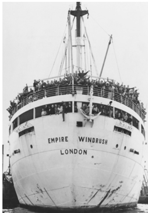
1948. The Empire Windrush brings 802 migrants from British colonies in the Caribbean.

There have clearly been changes in attitudes and behaviour since the demographic changes brought by immigration. However, this does not mean discrimination has disappeared. As well as racism towards non-whites, there is Islamophobia, racism towards white East Europeans and Gypsies/Roma, and antisemitism towards Jews. In 2018 The Conservative government was accused of creating a 'hostile environment' that led to the wrongful deportation of members of the 'Windrush generation' who had lived in the UK for decades.