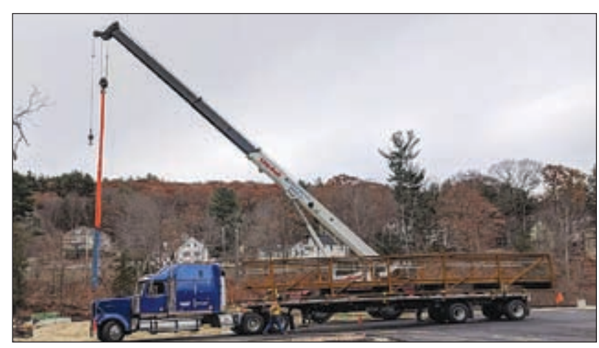
Segments of the new footbridge, which will connect Depot Square Park with the new Riverwalk parking lot have arrived and are in the process of being unloaded & joined, and are scheduled to be installed this week. (weather permitting).

beers brewed on site. The brewery opened this summer, and sells its beer exclusively at its tap room, she said. The business does offer growlers of beer for people to take home.