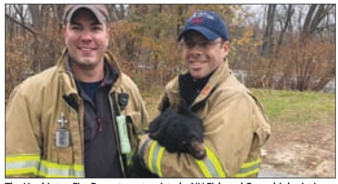
The Hopkinton Fire Department assisted a NH Fish and Game biologist in the removal of a small bear cub in a tree behind Dimitri's Pizza. The bear was tranquilized and relocated.