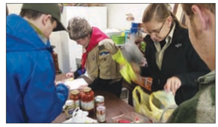
Antim Troop 2 Boy Scouts collected over 3200 food items for the Antrim-Bennington Food Pantry and the families it serves.