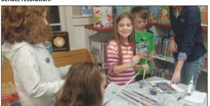
Children made their own wand creations at the Harry Potter After School Club at the Newbury Public Library.