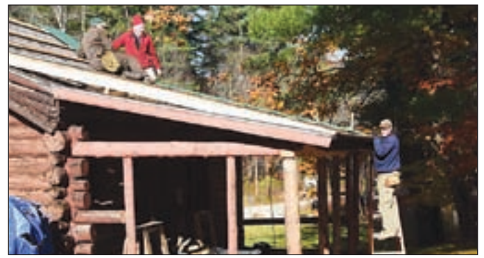
Members of the Hopkinton Lions Club were busy repairing roofs at Kimball Cabins.