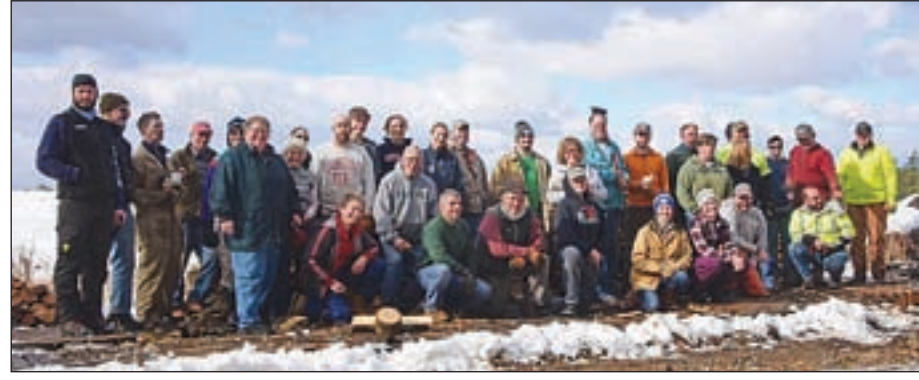
Saturday was "Wood For Warmth Day" in Hopkinton and volunteers turned out in force.