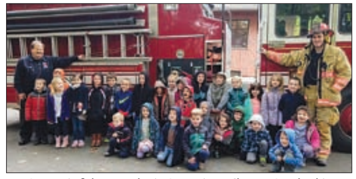
New Boston Firefighters taught Fire Prevention at Chestnut Preschool & Kindergarten.