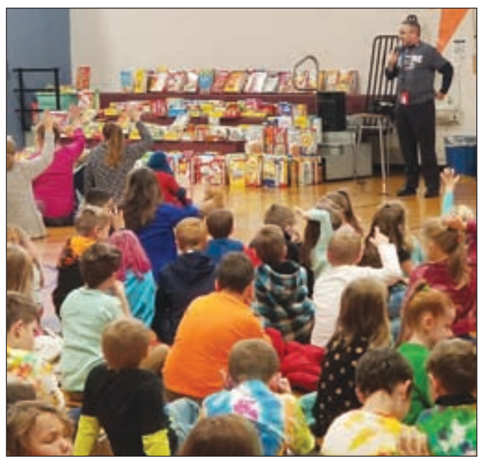
Hillsboro-Deering elementary school collected 375 boxes of cereal for the Hillsboro Food pantry as part of world kindness day.