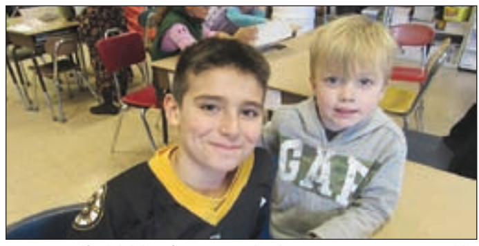
KRES at Bradford did their first Caring Schools Community Cross-age Buddy Activity to help students develop positive relationships by pairing older student with younger students.