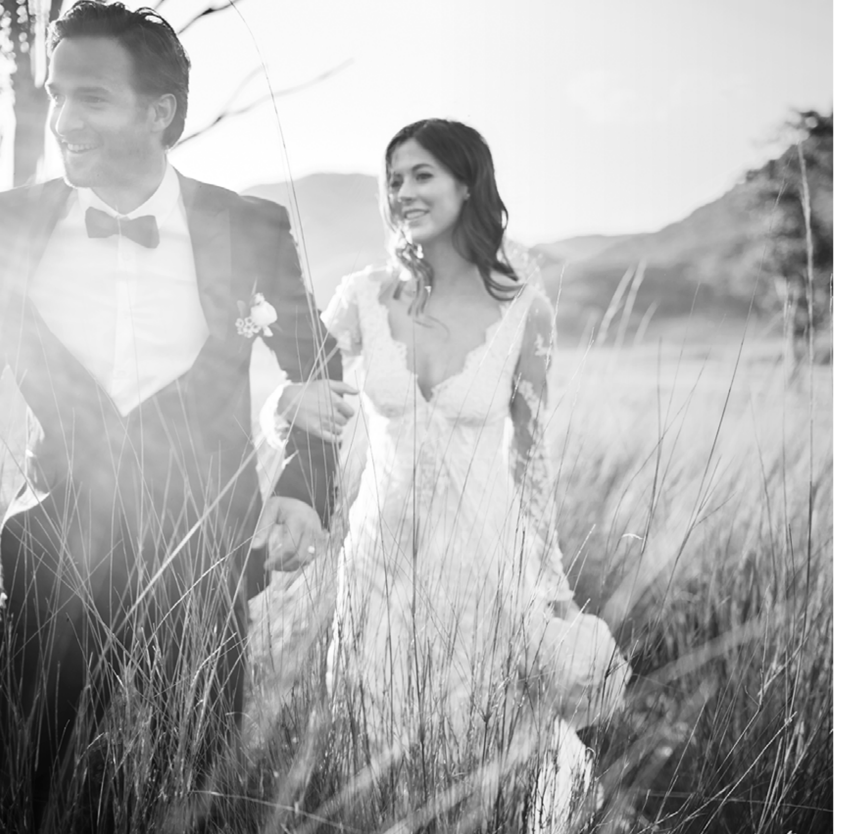
A place to make your PROMISE.

Before the enchanting Heritage Homestead, beneath the old elm tree. In the elegant Valley Bar Lounge, with a cosy fireplace and terrace beyond. Out on an isolated deck, immersed in wilderness, under an open sky. Or in the surrounds of our quaint Country Kitchen, flooded with light and uninterrupted views.