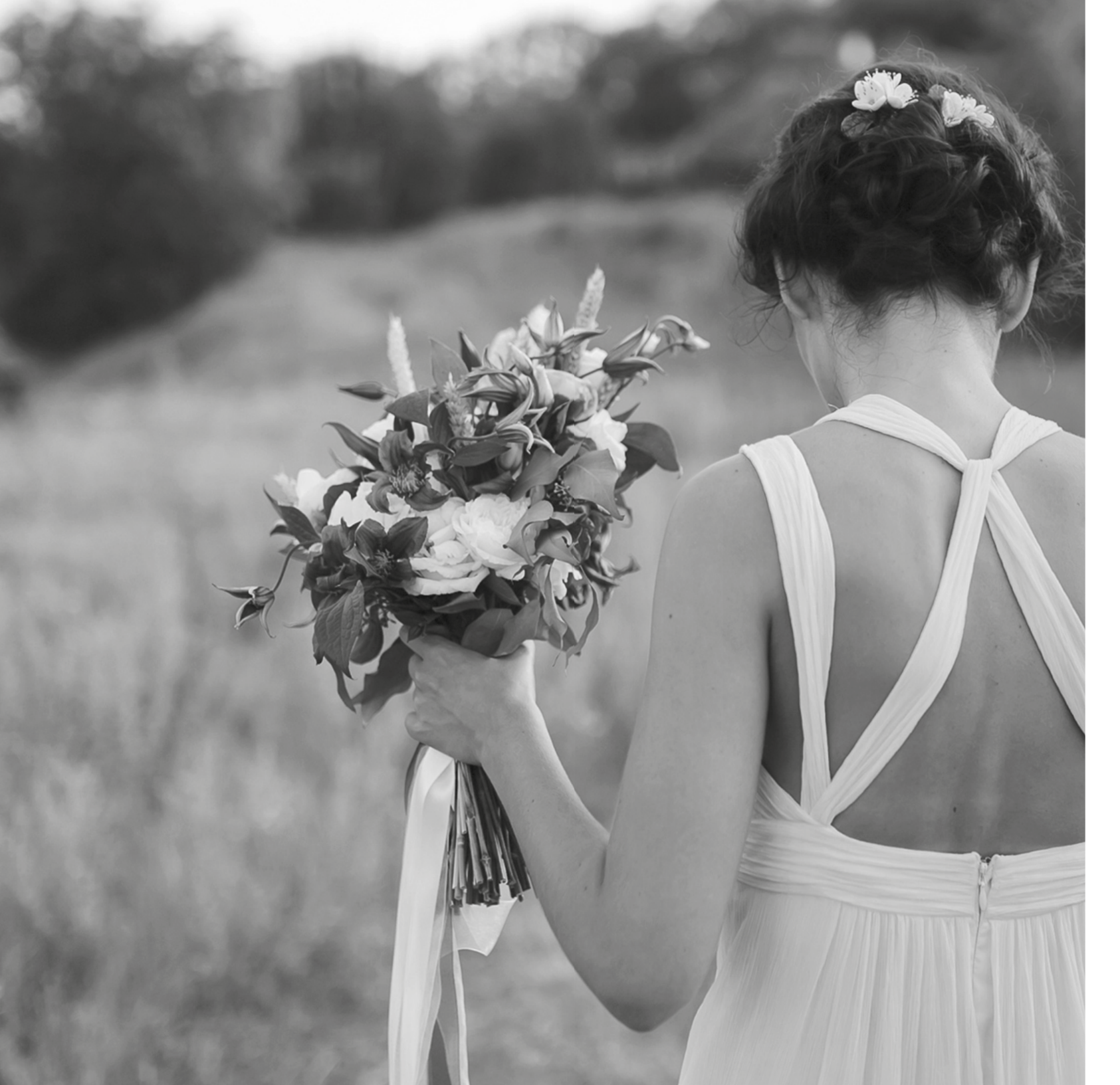
You say 'I DO' and we do the rest.

At Emirates One&Only Wolgan Valley, we're skilled in the art of planning a wedding, but this is the first time we have planned yours; and here, no two weddings are ever the same. There's no template, no cookie-cutter. We begin with a blank page and endless possibilities.