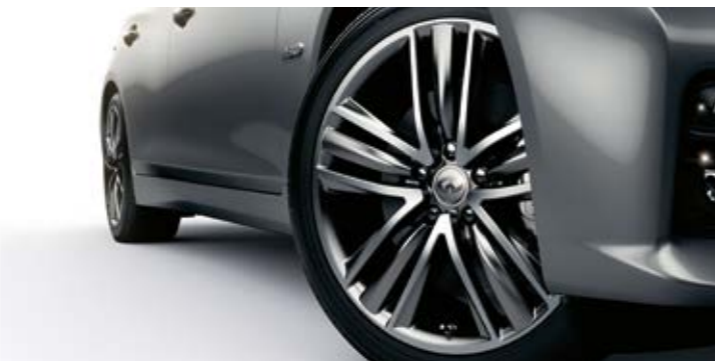
19 INCH, 5 TRIPLE-SPOKE ALUMINIUM-ALLOY WHEELS WITH RUN-FLAT TYRES