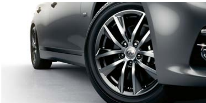
17 INCH, 5 DOUBLE-SPOKE ALUMINIUM-ALLOY WHEELS WITH RUN-FLAT TYRES