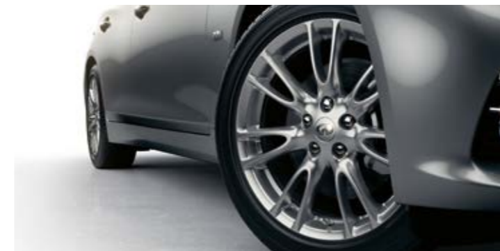
18 INCH, 7 DOUBLE SPOKE ALUMINIUM-ALLOY WHEELS WITH RUN-FLAT TYRES