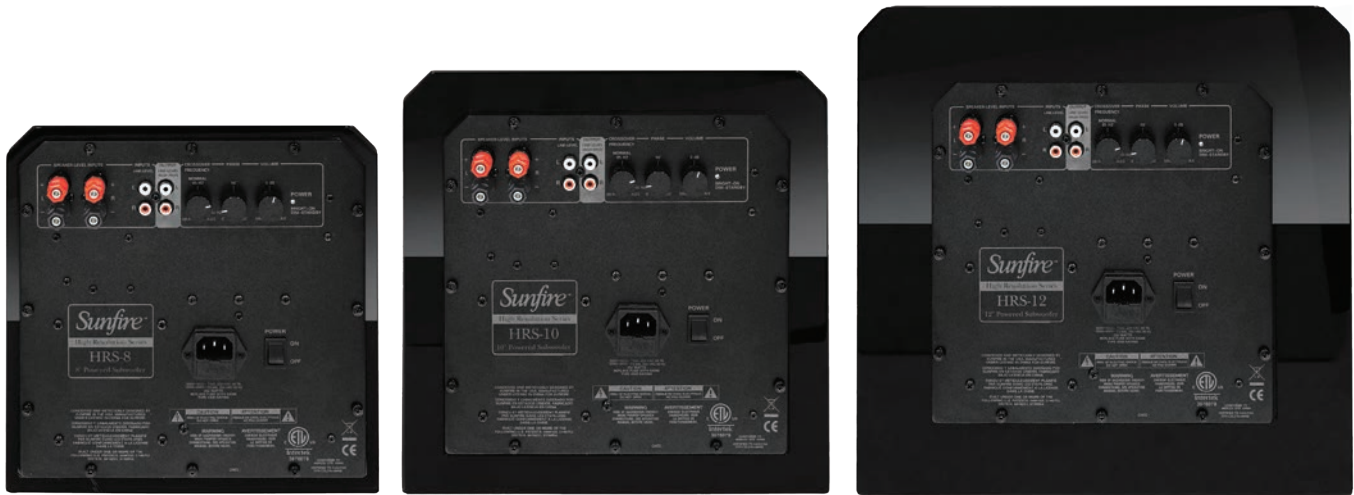
Back panel of HRS-8, HRS-10 and HRS-12