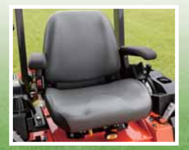
HIGH BACK SEAT

Soft and roomy, the high back seat will keep you comfortable even on those extra-long mowing jobs.