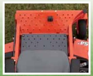
WIDE FOOT PAN

Soft and roomy, the high back seat will keep you comfortable even on those extra-long mowing jobs.