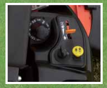
ERGONOMIC CONTROL LAYOUT

A simple twist of a dial lets you adjust the cutting height in precise 1/4" increments.