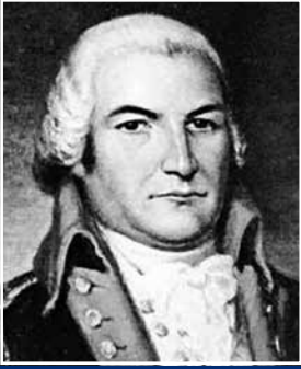
Moses Cleaveland the founder of Cleveland, Ohio. Following the American Revolution, U.S. settlers began to migrate westward

in large numbers. There were lengthy disputes about the ownership of this land. The federal government encouraged the states to give up their claims within the Northwest Territory. Connecticut was one of the states with land claims in Ohio. While giving up its rights to most of the land, the state maintained its ownership of the northeastern corner of the territory. This area became known as the Connecticut Western Reserve. The Connecticut Land Company was a group of private speculators who purchased approximately three million acres of the Western Reserve.