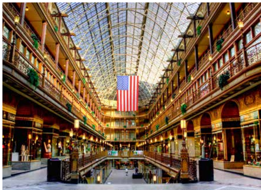
The Arcade Cleveland