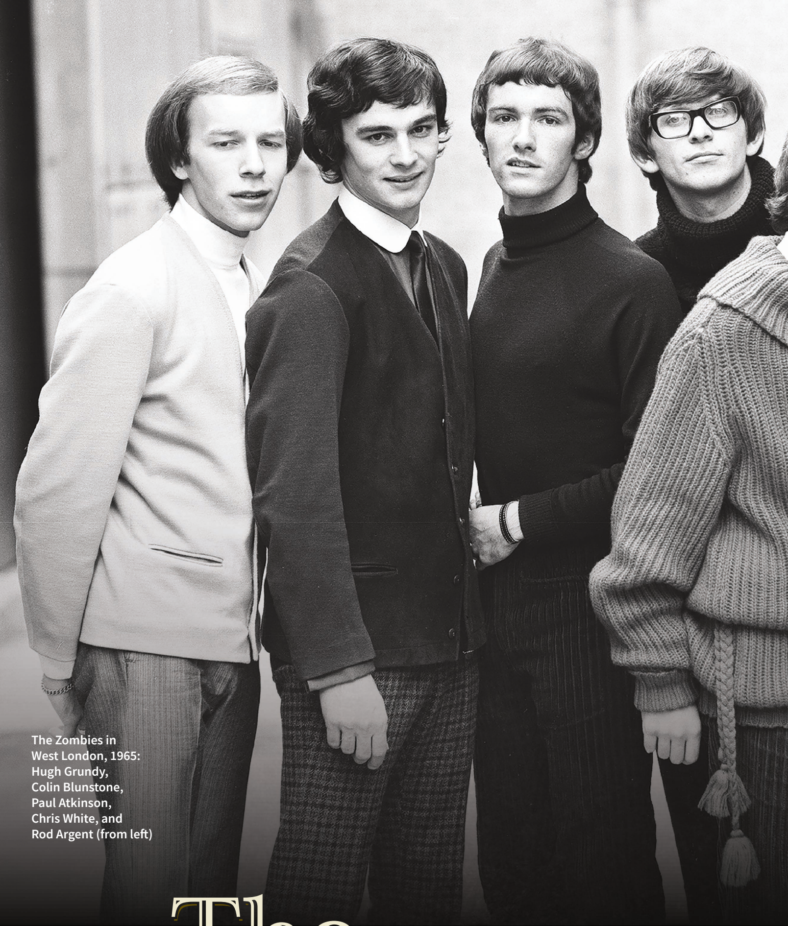
The Zombies in West London, 1965: Hugh Grundy, Colin Blunstone, Paul Atkinson, Chris White, and Rod Argent (from left)