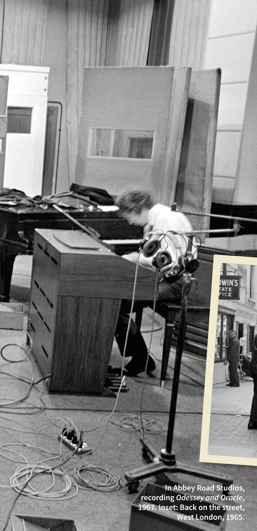
In Abbey Road Studios, recording Odessey and Oracle , 1967. Inset: Back on the street, West London, 1965.

Generations of critics and an ever-growing cult fan base raised Odessey and Oracle to its status as one of the most cherished and revered albums of late-1960s British rock.