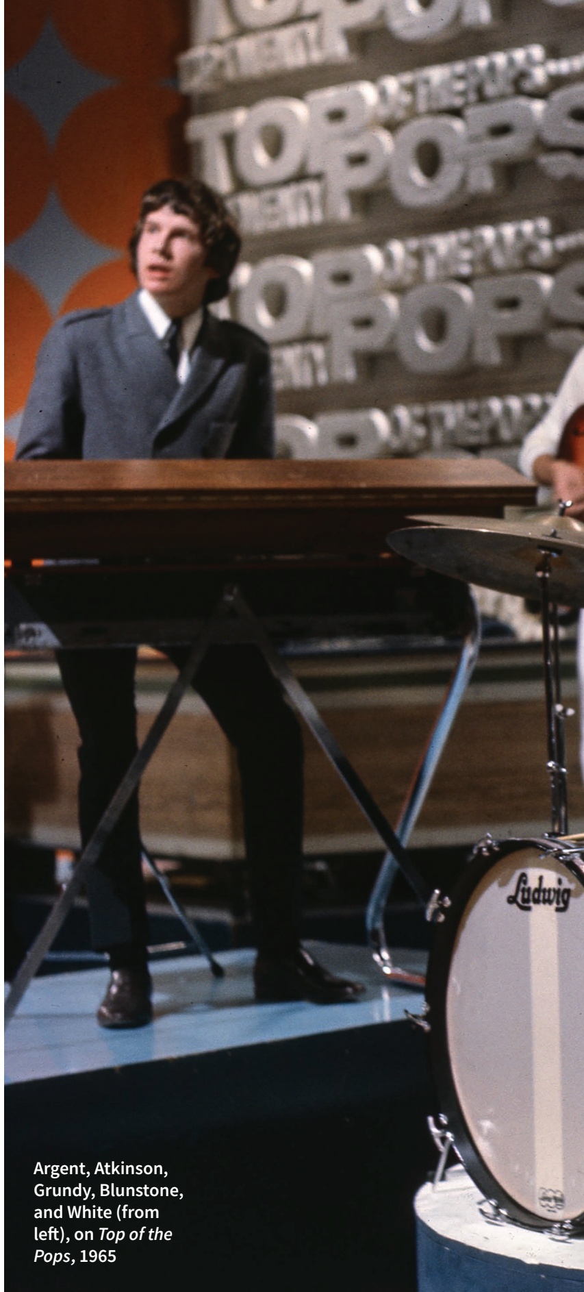
Argent, Atkinson, Grundy, Blunstone, and White (from left), on Top of the Pops , 1965

Inexplicably, despite playing Murray the K's Christmas Show at the Brooklyn Fox, appearing on the first episode of Hullabaloo , and then embarking on a multi-week Dick Clark Caravan of Stars tour, the