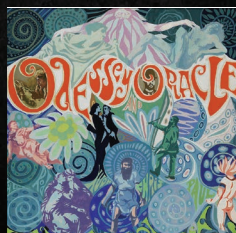
Odyssey and Oracle 1968 (Date/Columbia)