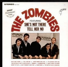
The Zombies 1965 (Parrot)