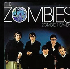
Zombie Heaven 1997 (Big Beat/Ace)