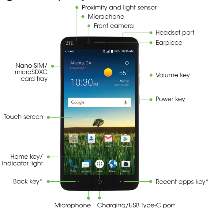
ou can switch the positions of the Back key and Decent apps