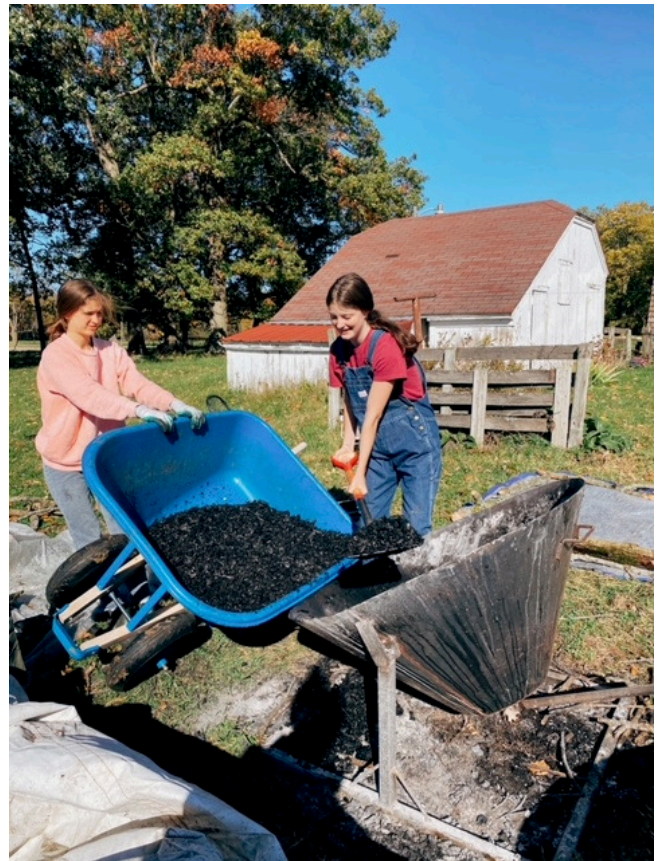
Zumwalt Acres research with biochar

Recent updates from the Zumwalt Acres team report producing 3,200 litres of biochar. They have collected and analyzed over 100 soil and 30 biochar samples. The team will also share their findings through webinars and publications. They presented their research at Savanna Institute's 2020 Perennial Farm Gathering, a conference with over 400 attendees.