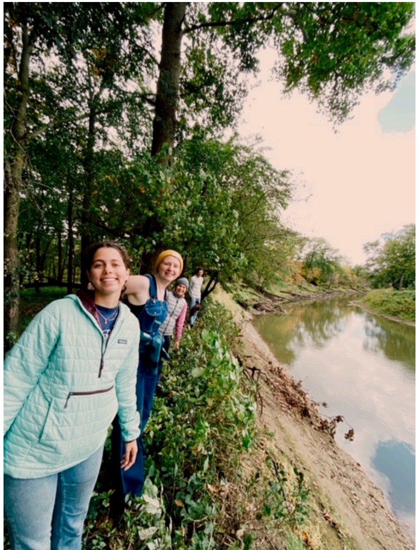
Apprentices consider a riparian buffer along the Iroquois River

As one reads the daily farm journal entries, written and posted by Remi, descriptions of mouth-watering meals whet one's appetite for home-cooking on the farm. Aromas and images resonate of whipped sweet potatoes, spaghetti squash, Kasha Varnishkes, spinach palak paneer, fried squash blossoms stuffed with mushrooms, blueberry compote, Challah bread, yellow curry, and lentil soups. The end of long work days culminate in team-prepared and shared meals that reawaken one's awareness of culinary possibilities from the garden, particularly during the weekly observance of Shabat, when there is more time for preparing a feast on a day of rest. One half acre is dedicated to vegetable production at Zumwalt Acres, where a great deal of planning, cultivating, and weeding happens in order to keep the diverse harvests, more than 90 varieties, abundant throughout the seasons.