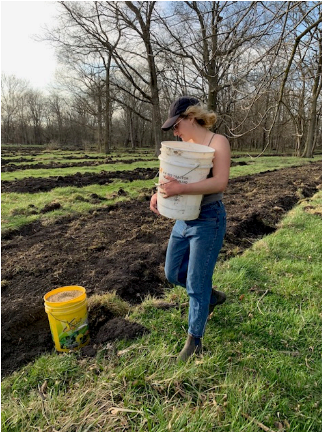
Preparing the beds - Credit: Remi Welbel

In the Jewish faith, when it comes to harvesting, there are several tenets that have been traditionally honored to assure that food is left for the less fortunate and poor. One is referenced on Zumwalt Acres' social media. “Leket” in Hebrew means collect. “It commands that ears of grain that fall to the ground be left in the field to make food accessible to those who wouldn’t have it otherwise.” A portion of the vegetables and food grown at Zumwalt Acres always goes to various food shelves and food banks in the area, in observance of these values.